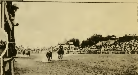
HE SNAPPED THE ROPE.